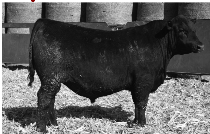
Lot 3 | C-1 Craftsman 419

Suggested for use on larger framed heifers or cows. Docile, deep-bodied, powerful son of Craftsman that comes with great shape of muscle. Dam is an extremely deep-bodied daughter of EXAR Upshot with a fantastic udder.