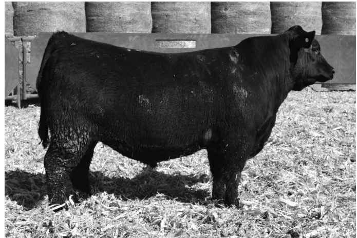
Lot 7 | Craftsman Payweight KD 439