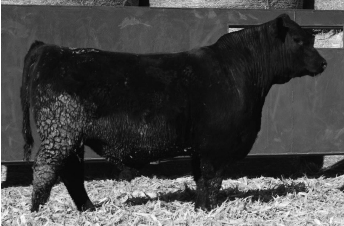
Lot 24 | Treffer Fairtime 416