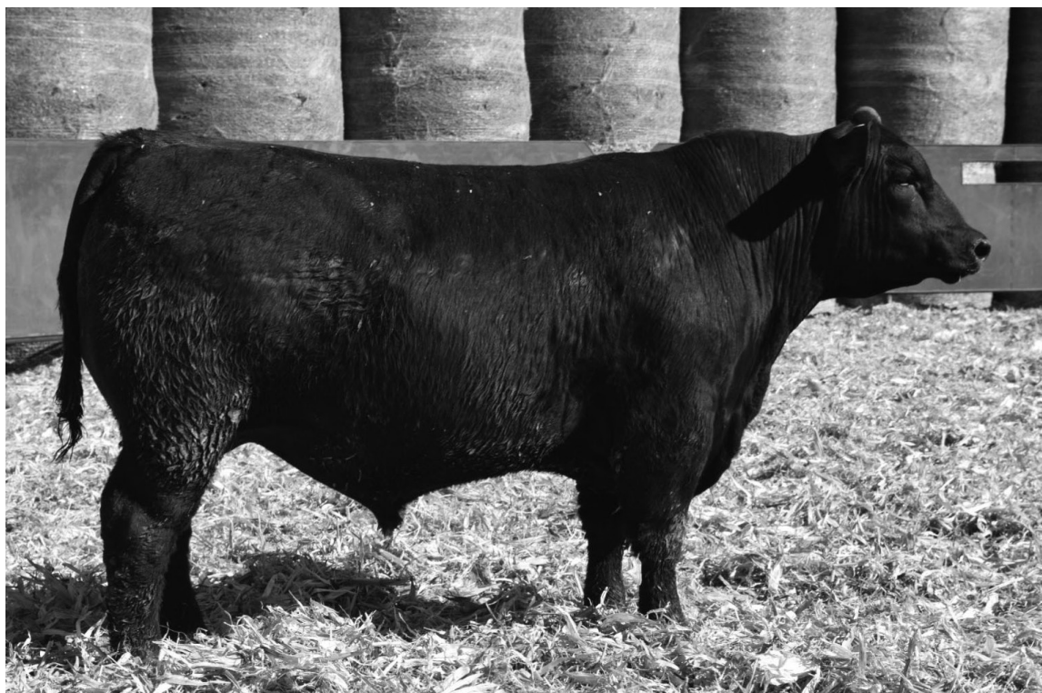
Lot 1 | C-1 Craftsman 44