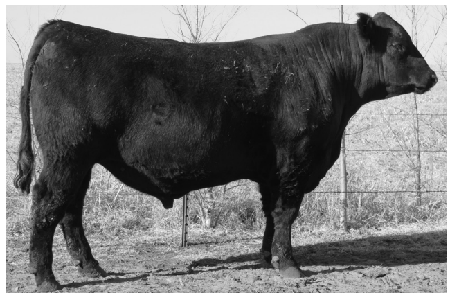
Lot 63 | Cade International KD 379

This Cade son is a true powerhouse. He is big framed, deep ribbed and thick from end to end. He is heavy boned and moves on a long stride.