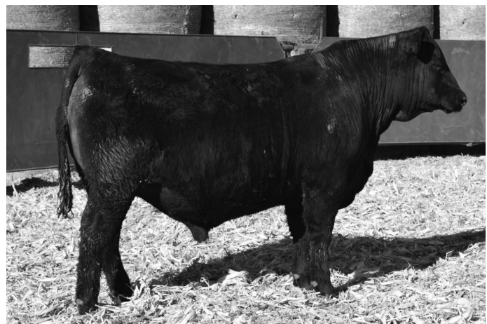
Lot 16 | Treffer Pacific 432

This is a long sided, deep bodied bull that has excellent natural thickness. His maternal brother went to North Dakota as a top seller from last year's sale.