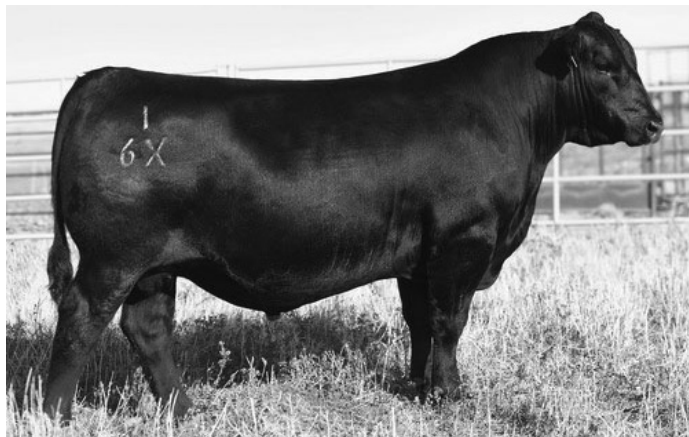
Connealy Rowden | Reg: 20132389