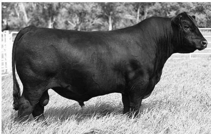
SG Salvation | Reg: 19559741

Common Ground is the sire of Connealy Pure Country 297X - 20439167.