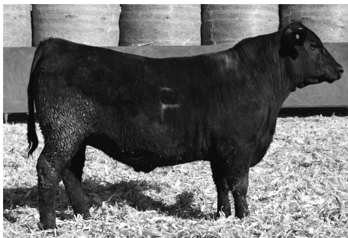
Lot 22 | Treffer Commerce 442

A favorite since birth with performance, lots of muscle volume and very good feet and legs. Dam is from the Dee family like Lots 21 and 51. Recommended for heifers and cows. Dam has 5 calves with 103 average wean ratio.