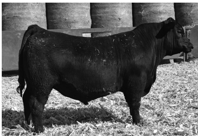
Lot 20 | C-1 Commerce 425