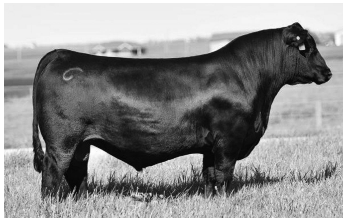
Connealy Common Ground | Reg: 19829219

Common Ground is the sire of Connealy Pure Country 297X - 20439167.