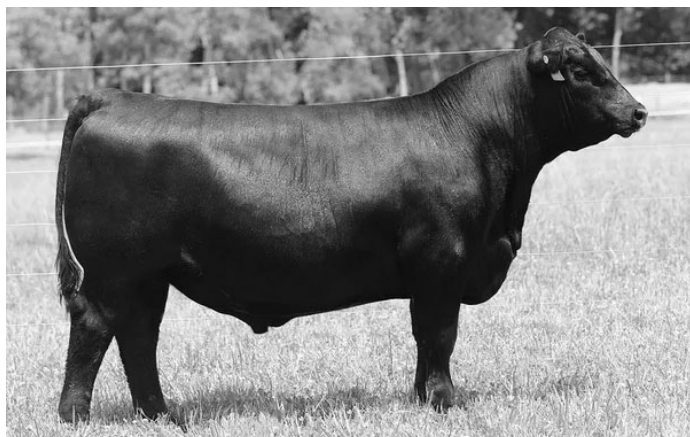
Linz Crown Point 9705 | Reg: 19512223