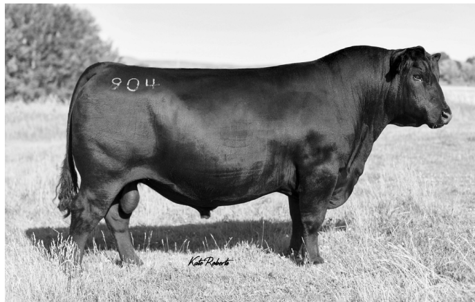
Sterling Pacific 904 | Reg: 19444025