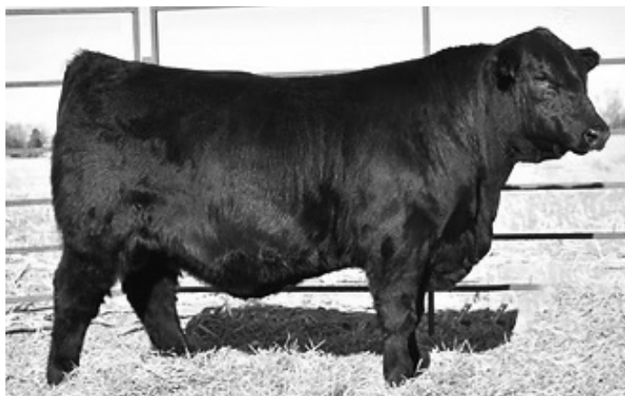
LBDR 2531 Resilient | Reg: 20508091

SG Salvation is the sire of Connealy Rescue 15V - 20385901