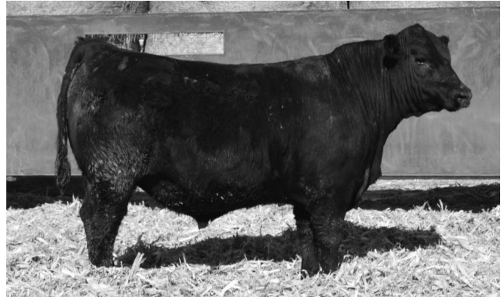
Lot 54 | Treffer Resolute 457