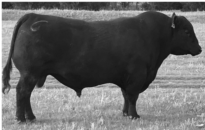
Connealy Cade 5114 | Reg: 19548026