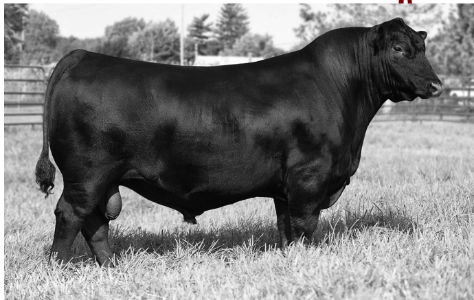
Connealy Craftsman | Reg: 20132505