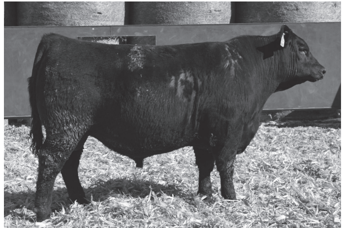
Lot 49 | Grit General KD 434

General is a very complete son of our new herd sire True Grit that was the high selling bull calf from the LaGrand Dispersion in South Dakota. He is deep bodied with tremendous thickness from end to end.