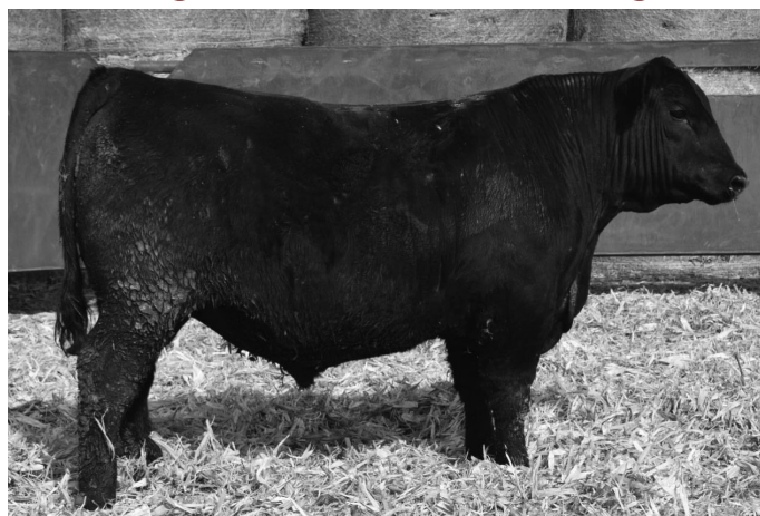
Lot 35 | DAR KC's Cadillac 448