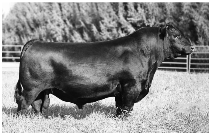
Myers Fair-N-Square M39 | Reg: 19418329