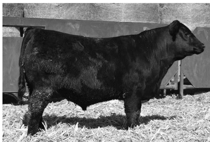
Lot 42 | Country Payweight KD 436

Pride is a larger framed Country son that is deep bodied and thick. His grand dam is an elite pathfinder cow.