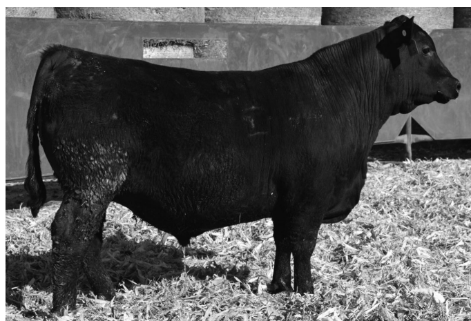
Lot 31 | Treffer North 414

Very easy fleshing True North with exceptional volume and depth of side. Recommended to use on heifers. His Stellar dam was a heifer that's off to a great start with this bull's 115 weaning ratio.