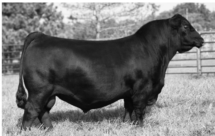
Connealy Commerce | Reg: 20132642