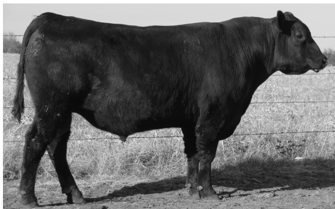
Lot 64 | Craftsman Answer KD 390

A very complete Craftsman son. He is extended through his front one third, long sided and has excellent natural thickness.