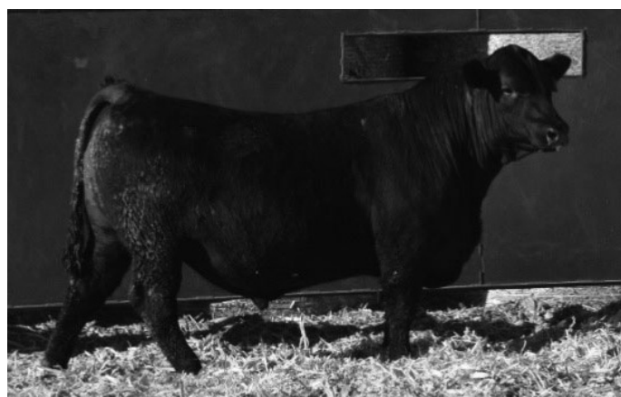
Lot 27 | Treffer Patriarch 446

Our only Patriarch son. For a calving ease bull, he's exceptionally high volume and soft in his look. Top performer. It wasn't the target but he gained over 5 pounds per day on test.