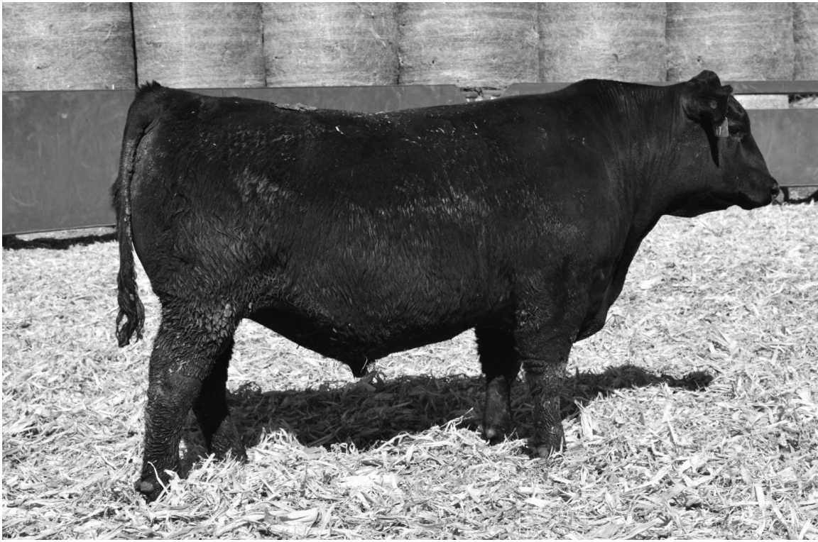
Lot 12 | DAR South Pacific 410