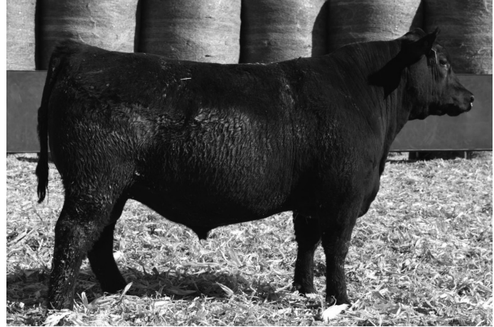
Lot 13 | DAR Ali's Pacific Legend 413