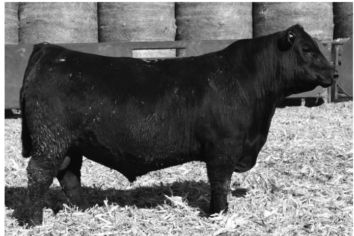
Lot 19 | C-1 Commerce 48

Suggested for use on cows. A long, deep bodied herd bull prospect with great muscle shape and outstanding growth. Wide from the rear and extremely stylish. Retaining 1/3 semen interest.