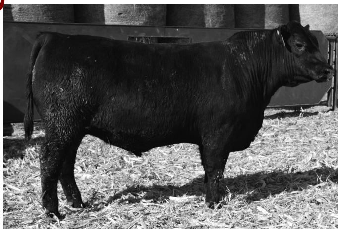
Lot 44 | C-1 Rescue 46

Suggested for use on heifers. A very attractive bull that has great depth of body and a powerful hip.