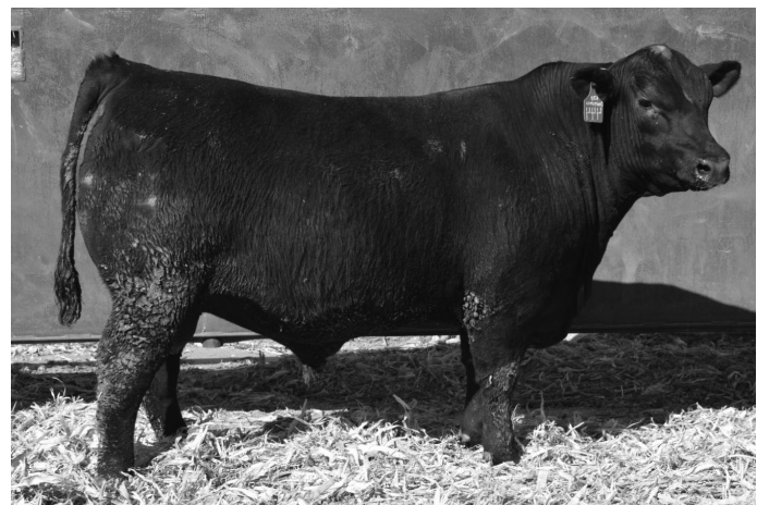
Lot 10 | DAR Craftsman King 444