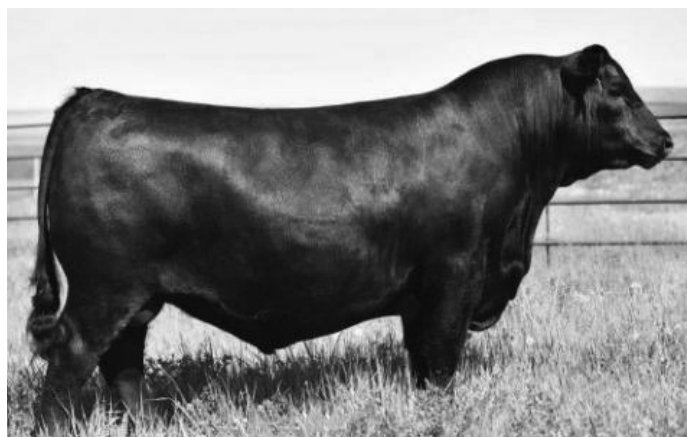
LAR Man In Black | Reg: 19955191