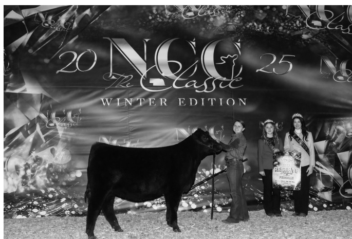
Lot 13 and the Reserve Champion Angus Heifer at the 2025 NCC share the same grand dam, DAR Ali's Blackbird 827!