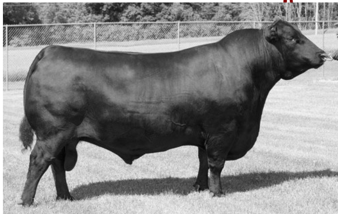
Square B True North 8052 | Reg: 19405246